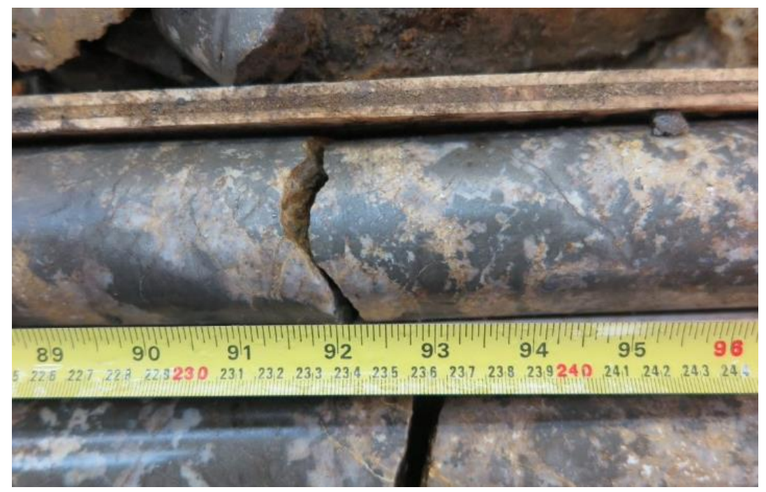
Photo 3. N21-05 at 174.14m – Semi-massive sulphide (marcasite +/- pyrite dominant) replacement within iron carbonate altered YTT (Big Creek South Fault area).