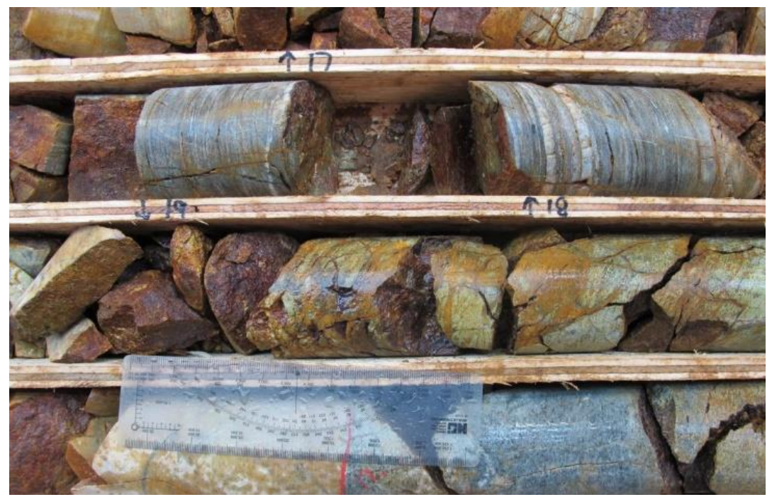
Photo 1. N21-01 at 19m – Oxidized limonite after pyrite skarn replacement mineralization within YTT (Nucleus Deposit)