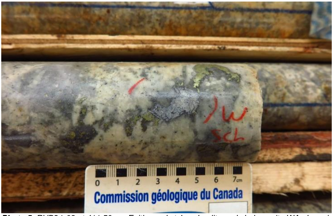
Photo 5. RVD21-03 at 411.50m – Epithermal style scheelite and chalcopyrite WAu breccia mineralization within argillic altered Revenue granodiorite.