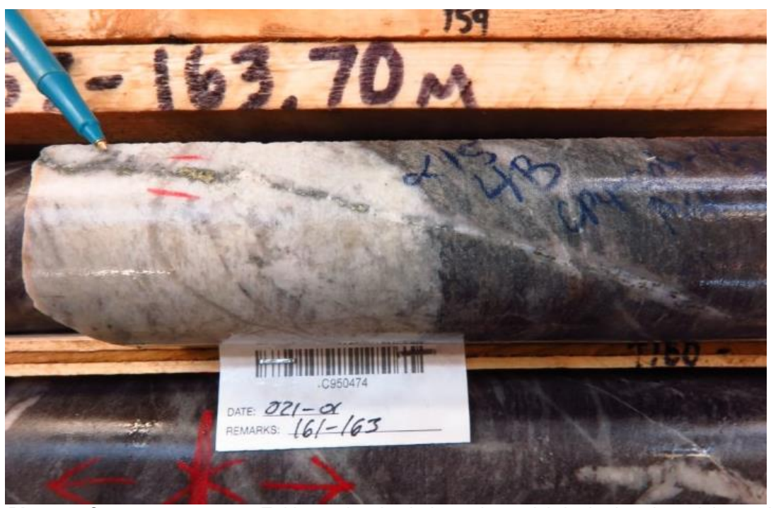
Photo 4. O21-01 at 159.8m – Epithermal style chalcopyrite-molybdenite-bornite veinlet cutting Microgranite and YTT (Orbit Zone).