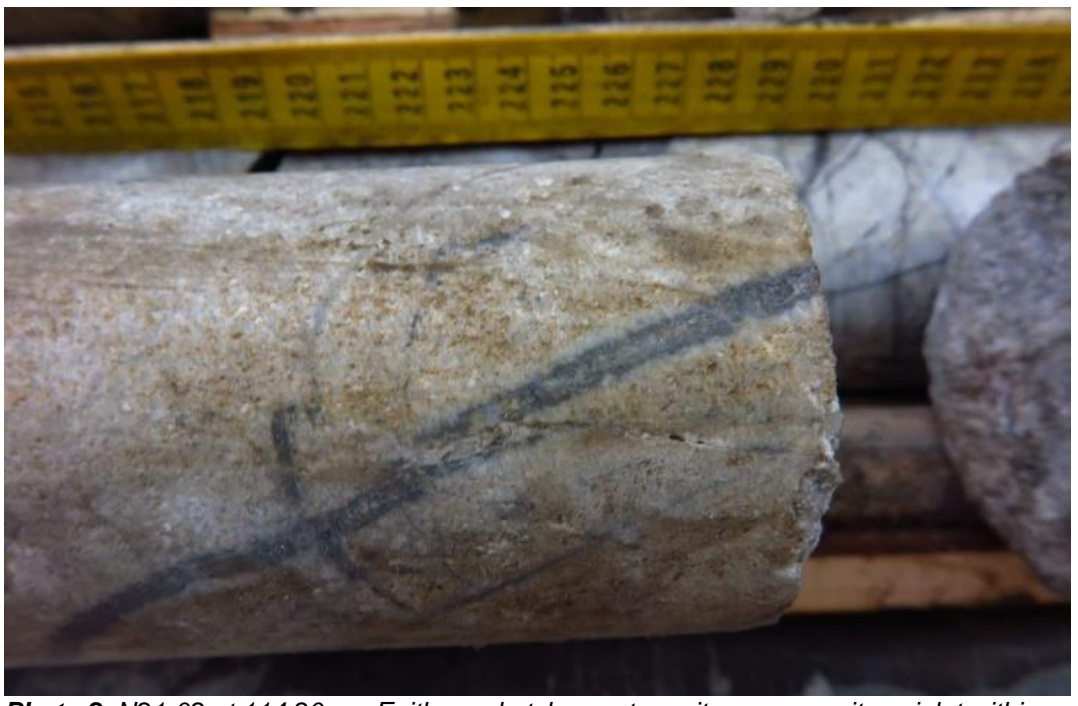
Photo 2. N21-02 at 114.20m – Epithermal-style quartz-pyrite-arsenopyrite veinlet within argillic altered YTT (Nucleus Deposit)