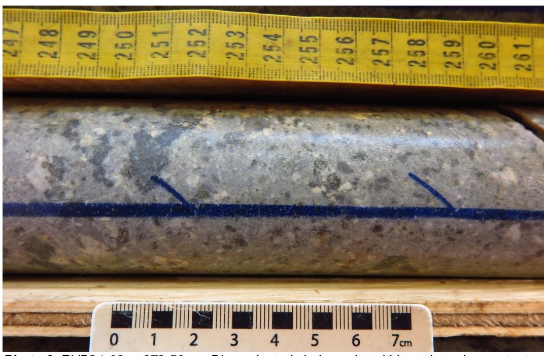
Photo 6. RVD21-03 at 372.50m – Disseminated chalcopyrite within an intrusive contact breccia in the hanging wall of the WAu Zone.